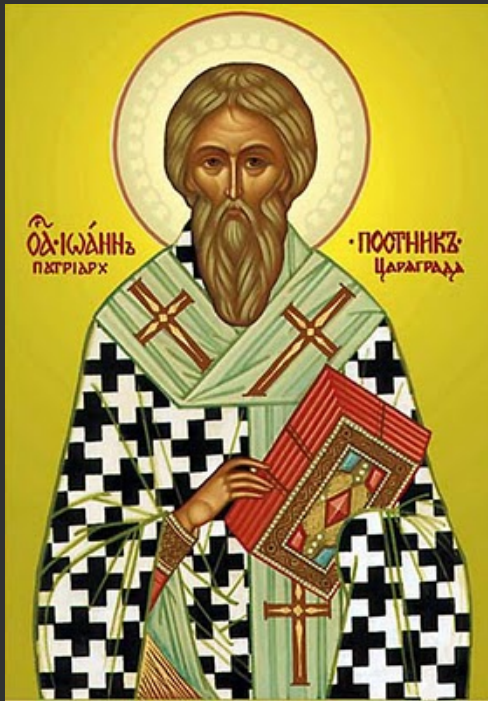
John the Faster 582-595