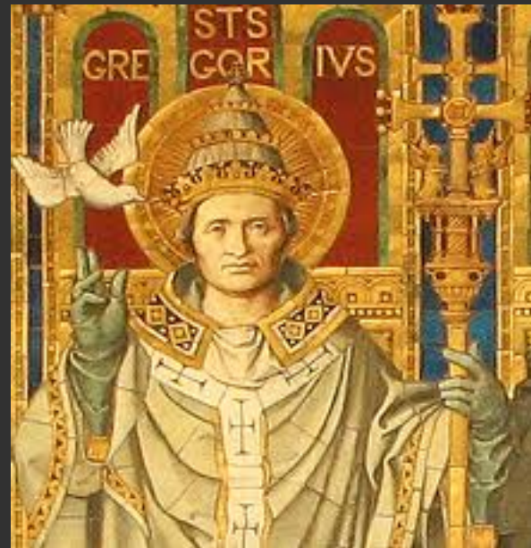
Gregory the Great 590-604